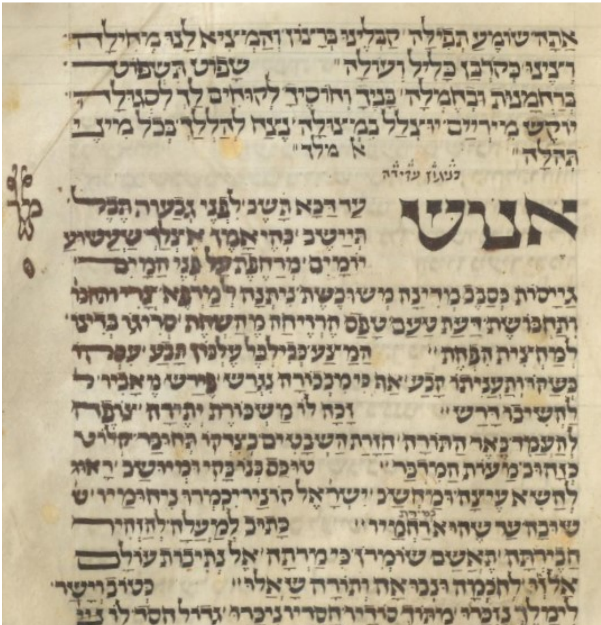
Figure 2. 'Enosh 'ad daka tashev' with the Indication Be-niggun 'Akedah (Karlsruhe, Badische Landesbibliothek, Cod. Reuchlin 7, 63r)

lamentation of Ninth of Av, 19 conceivably because the imperial deportation edict was issued close to that date.