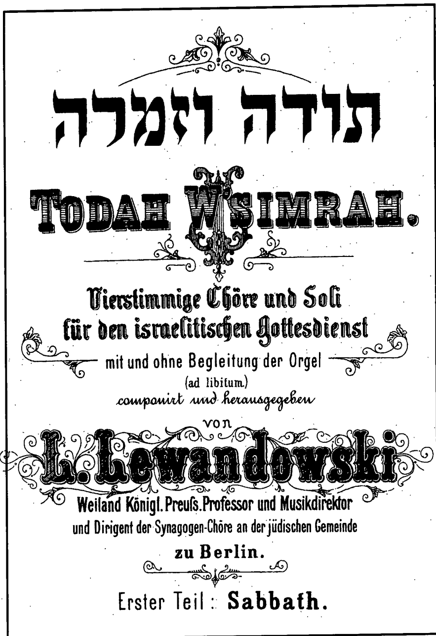
Example 8a. Title page of L. Lewandowski, Todah W'zimrah , 1876.