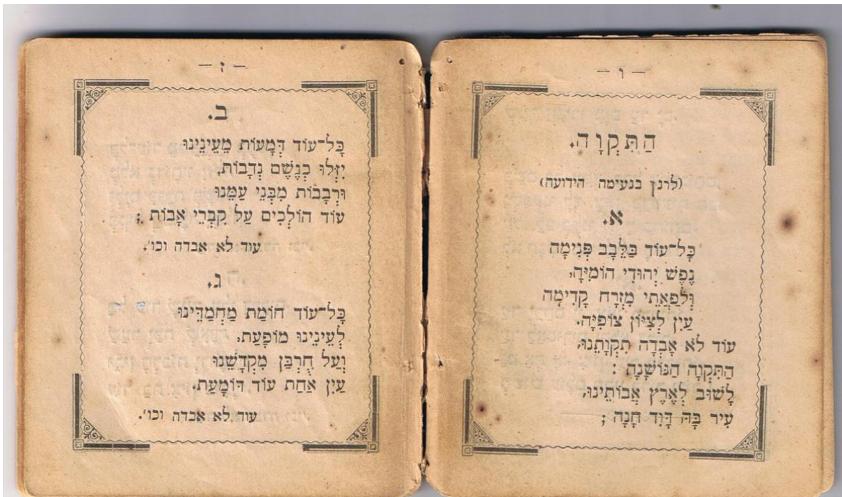
Figure 2. Hatikvah in Shirei 'am-tziyyon

The text of Imber's Tikvatenu was not bound to remain a stable written one once it started to circulate orally. It underwent, in the process of its reception and musical performances, changes and adaptations. The printed version of 1886 is apparently not the original one and resulted from the contacts between the poet and teachers of the Rishon le-Tziyyon school who hosted Imber, such as Israel Belkind, Mordecai Lubman and David Yudlovitch. Some of these changes, included the new title of Imber's song, Hatikvah , appeared already in the songster 'Shirei 'am-tziyyon'. 5 According to Hacoheh (see above note 3) and Shahar (see below note 20), further changes in the text were introduced by Dr. Yehuda Leib Matmon-Cohen (1869-1939), who immigrated to Palestine in 1905, served as a school teacher in Rishon le-Tziyyon in that year and later founded the famous Gymnasia Herzliyah in Tel Aviv-Jaffa. The changes from Imber's 'Hatikvah ha-noshanah' to 'Hatikvah shnot alpayim' and from Imber's 'lashuv le'erezt avoteynu, le-yir bah David hannah' to 'Liyot 'am hofshi beartenu, Eretz Tziyyon Yerushalayim' are attributed to Matmon-Cohen.