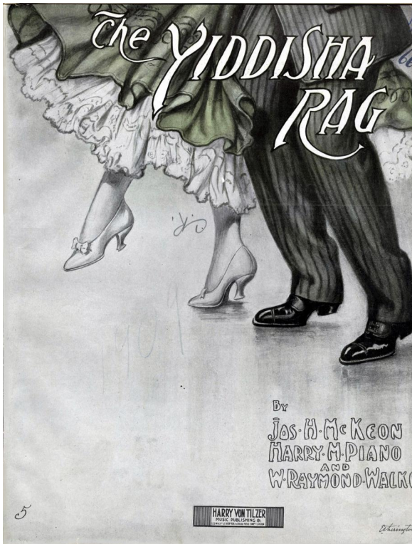
Figure 8 (left). The Yiddisha Rag title page