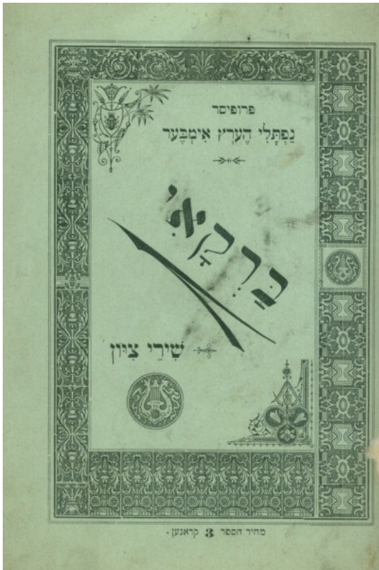
Figure 1. Title page of Naftali Herz Imber's Barkai (Jerusalem 1886)

Our hope is not yet lost, The hope of two thousand years, To be a free people in our land, The land of Zion and Jerusalem.