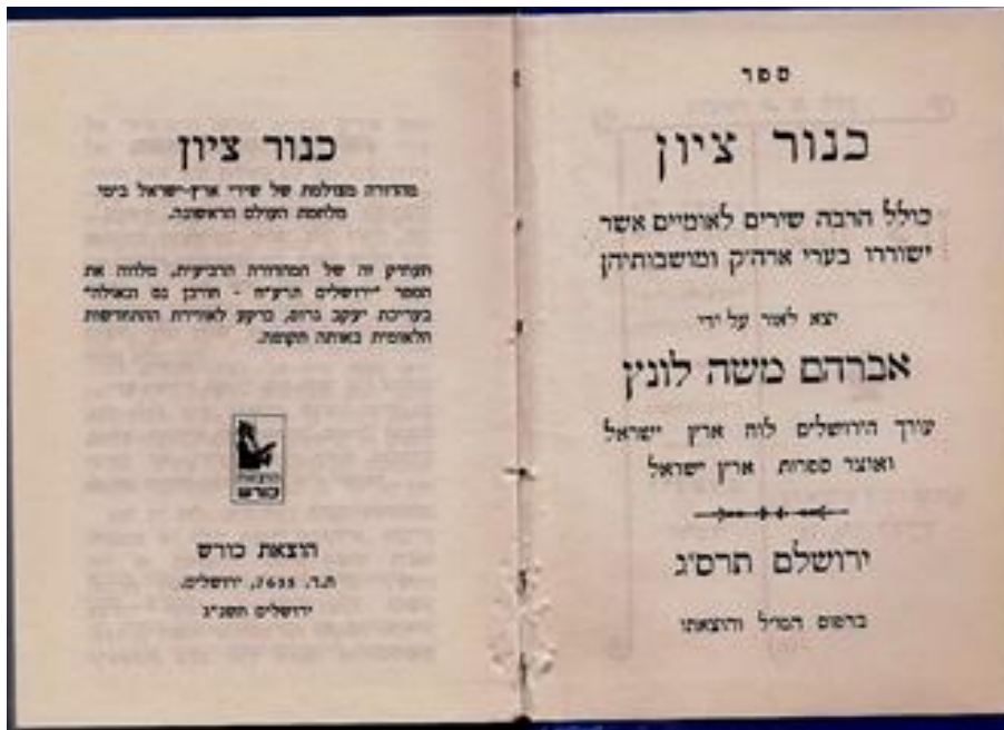
Figure 4. Title page of Kinnor Tziyyon (Jerusalem 1903)