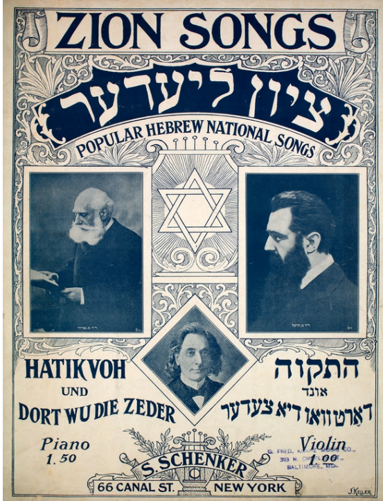
Figure 6 (left). Zion Songs: Popular Hebrew National Songs, title pag