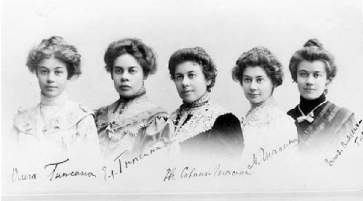
Figure 3. The Gnesin sisters. From left: Olga, Elena, Evgeniia, Maria, and Elizaveta. Founders of the Gnesin Musical Academy in Moscow.

Gnesin arrived in St. Petersburg in 1901 after having tried and failed to gain entrance to the Moscow Conservatory due to its antisemitic quotas. In St. Petersburg, by contrast, he was welcomed with open arms by the trio of legendary Russian composers: Rimsky-Korsakov, Glazunov, and Anatolii Liadov. To the young student, they represented musical gods: "Rimsky-Korsakov, Glazunov, Liadov," he wrote, "these were the stars in the heavens above St. Petersburg around which all of us worshipfully circulated." At the same time, these teachers were equally fascinated by their Jewish students. In fact, Liadov, Glazunov, and Rimsky-Korsakov together typified a spectrum of Russian attitudes towards Jews from antisemitism to philosemitism. 11