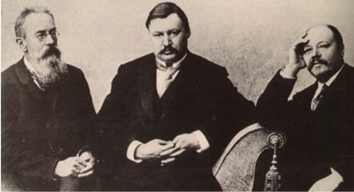
Figure 4. Nikolai Rimsky-Korsakov, Alexander Glazunov, and Antaloy Liadov (from left to right).

But as Gnesin noted, this philosemitic impulse even extended to those would-be Jewish musicians of questionable musical abilities: "This sentiment caused Glazunov occasionally even to violate the principles of art. Often, in order to help someone with an internal passport problem, he accepted a student with no musical talents." 18