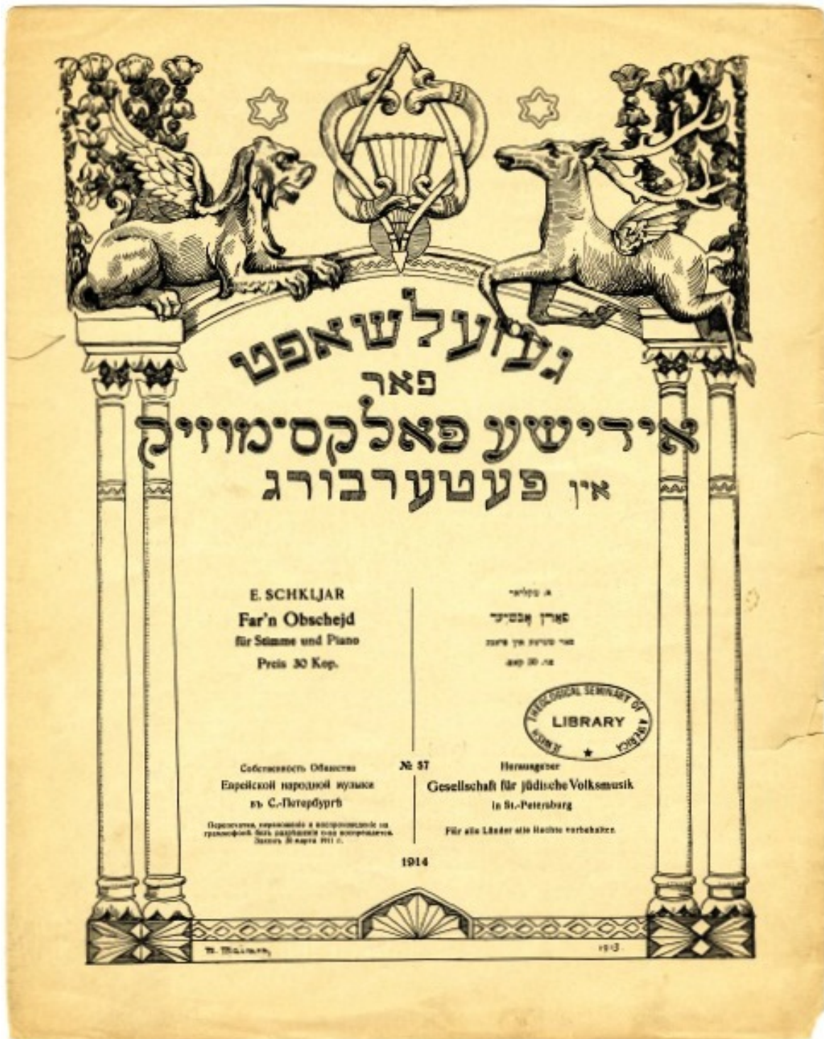
Figure 5. Ephraim Shkliar's Farn opsheyd, published by the Society for Jewish Folk Music, St. Petersburg, 1910.