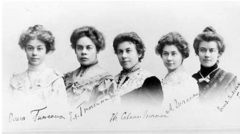
Picture 3: The Gnesin sisters. From left: Olga, Elena, Evgeniia, Maria, and Elizaveta. Founders of the Gnesin Musical Academy in Moscow.

Gnesin arrived in St. Petersburg in 1901 after having tried and failed to gain entrance to the Moscow Conservatory due to its antisemitic quotas. In St. Petersburg, by contrast, he was welcomed with open arms by the trio of legendary Russian composers: Rimsky-Korsakov, Glazunov, and Anatolii Liadov. To the young student, they represented musical gods: “Rimsky-Korsakov, Glazunov, Liadov,» he wrote, «these were the stars in the heavens above St. Petersburg around which all of us worshipfully circulated.” At the same time, these teachers were equally fascinated by their Jewish students. In fact, Liadov, Glazunov, and Rimsky-Korsakov together typified a spectrum of Russian attitudes towards Jews from antisemitism to philosemitism. 11