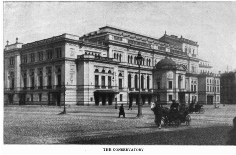
Picture 1: The St. Petersburg Conservatory, ca. 1910

There are many concrete historical reasons for this striking trend. 4 But in this article I want to discuss not its actual causes but instead the popular perceptions of the time that encircled this curious phenomenon, elevating it from a sociological pattern to a cultural myth. For the various contemporary explanations for Jewish musical achievement that circulated in the early twentieth century actually took on a life of their own, influencing the national character of the Russian-Jewish musical movement. And the principal expression of that movement, the Society for Jewish Music, owes its origins in large part to the shared obsession of Russians and Jews with the dramatic spectacle of Jewish musicians at the St. Petersburg Conservatory.